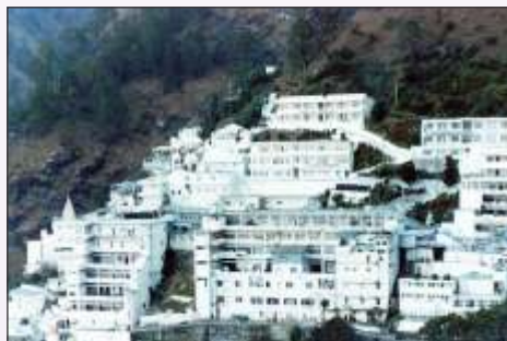
Vaishno Devi Temple